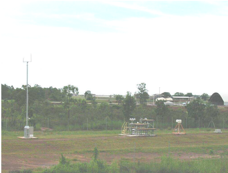
Fig. 4. Darwin Instrument Field

The site hosts the same standard set of ARCS instruments as on Manus and Nauru (See Appendix). Nauru has an Atmospheric Emitted Radiance Interferometer (AERI), a CIMEL Sunphotometer, and a Total Sky Imager (TSI) that are not implemented at Manus and Darwin. A TSI will be installed at Manus and Darwin in the future. A Balloon-Borne Sounding System (BBSS) is not deployed at Darwin as that data will be obtained from the BOM Observing Station next door to the site. Figures 5-8 show some of the instrument installations at Darwin.