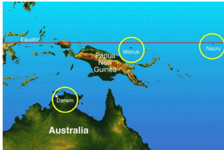
Fig. 1. TWP ARCS sites at Manus, Nauru and Darwin.

The United States Department of Energy's (DOE) Atmospheric Radiation Measurement (ARM) Program began operations in its Tropical Western Pacific (TWP) locale in October 1996 when the first Atmospheric Radiation and Cloud Station (ARCS) began collecting data on Manus Island in Papua New Guinea (PNG). See Fig. 1.