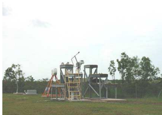
Fig. 6. Sky Radiation Stand