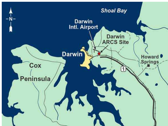
Fig. 2. Location of Darwin ARCS Site

The Darwin ARM site is located at 12.425°S, 130.891°E adjacent to the BOM Meteorology Office near the Darwin International Airport (Fig. 2). The center of the site