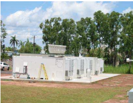
Fig. 5. ARCS Vans and Cloud Radar

The site hosts the same standard set of ARCS instruments as on Manus and Nauru (See Appendix). Nauru has an Atmospheric Emitted Radiance Interferometer (AERI), a CIMEL Sunphotometer, and a Total Sky Imager (TSI) that are not implemented at Manus and Darwin. A TSI will be installed at Manus and Darwin in the future. A Balloon-Borne Sounding System (BBSS) is not deployed at Darwin as that data will be obtained from the BOM Observing Station next door to the site. Figures 5-8 show some of the instrument installations at Darwin.