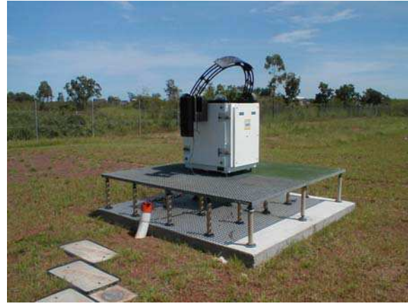
Fig. 8. Whole Sky Imager