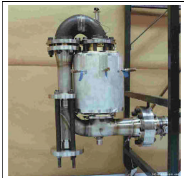
Figure 4. World's first TASHE

2. A thermoacoustic refrigerator/liquefier, either as a principle system or an emergency system, can be used in conjunction with liquid-nitrogen and liquid-oxygen dewars found behind most hospitals. The