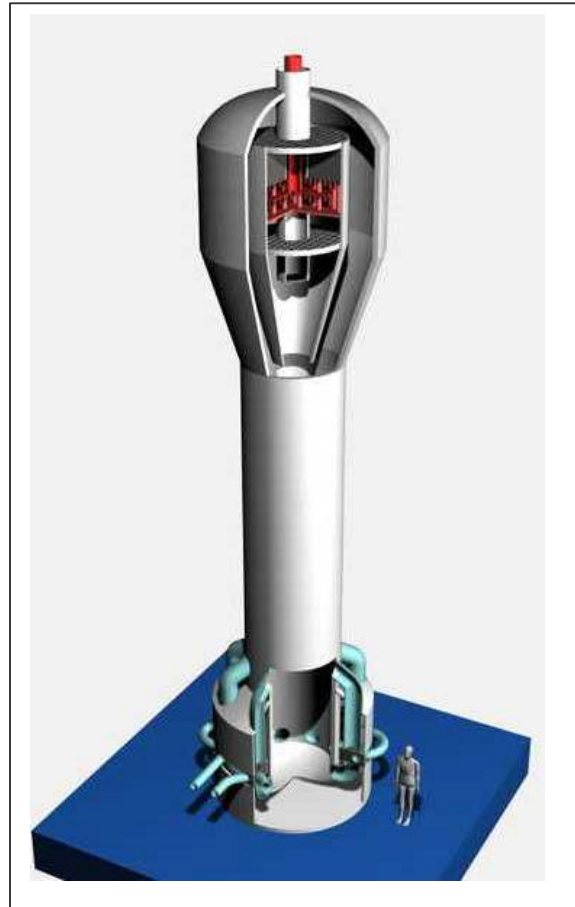
Figure 3. Conceptual configuration, 10,000 gpd TASHE-OPTR

This important milestone demonstrated for the first time that TADOPTR technology works at a capacity suitable for practical liquefaction of natural gas.