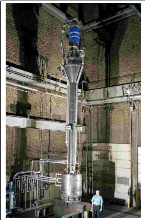
Figure 2. The 500 gpd TASHE-OPTR. The natural gas burner is at the very top. The TASHE is the large bulge below the burner and the OPTRs (not visible) are inside the vacuum jacket near the bottom.