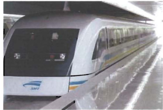
Figure 2. The high-speed, Chinese-Transrapid EMS-type MagLev train.

Nagakute Town to Yakusa Station on the Aichi Kanjo (Loop) Line in Yakusacho of Toyota City.