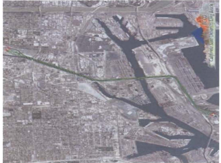
Figure 5. Map showing the proposed route for the cargo MagLev system between the Port of Los Angeles and an in-land distribution center. The route is about 4.7 miles long.

haul, where noise and atmospheric pollution abatement are significant concerns.