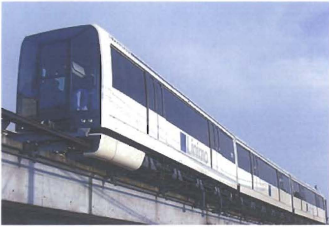
Figure 4. Picture of the Japanese, low-speed, EMS-type MagLev train on the Linimo line.

Other interesting MagLev development around the world include the Swissmetro MagLev concept designed to have vehicles running in small 5-m diameter tunnels under partial vacuum to reduce aerodynamic drag forces and the Brazilian concept using high temperature superconducting bulk magnets for levitation (Stephan & Nicolsky 2004).