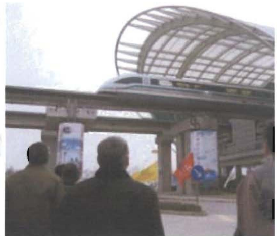
Figure 3. The Chinese-Transrapid train leaving the station on the route from Pudong to Shanghai.

It further emphasize the usefulness of MagLev for intermodal transportation. Figure 4 shows the Japanese urban MagLev train in operation. The HSST research was started in 1974 by Japan Airline and the JR High Speed MagLev system by Japan Railways in 1969. The HSST system is based on electromagnetic suspension technology and does not use superconductivity with a top speed of 38 mph.