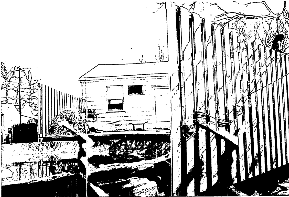
Fig. 4. Photo of the back of the house and yard, facing south. An above-ground swimming pool is in the left foreground.