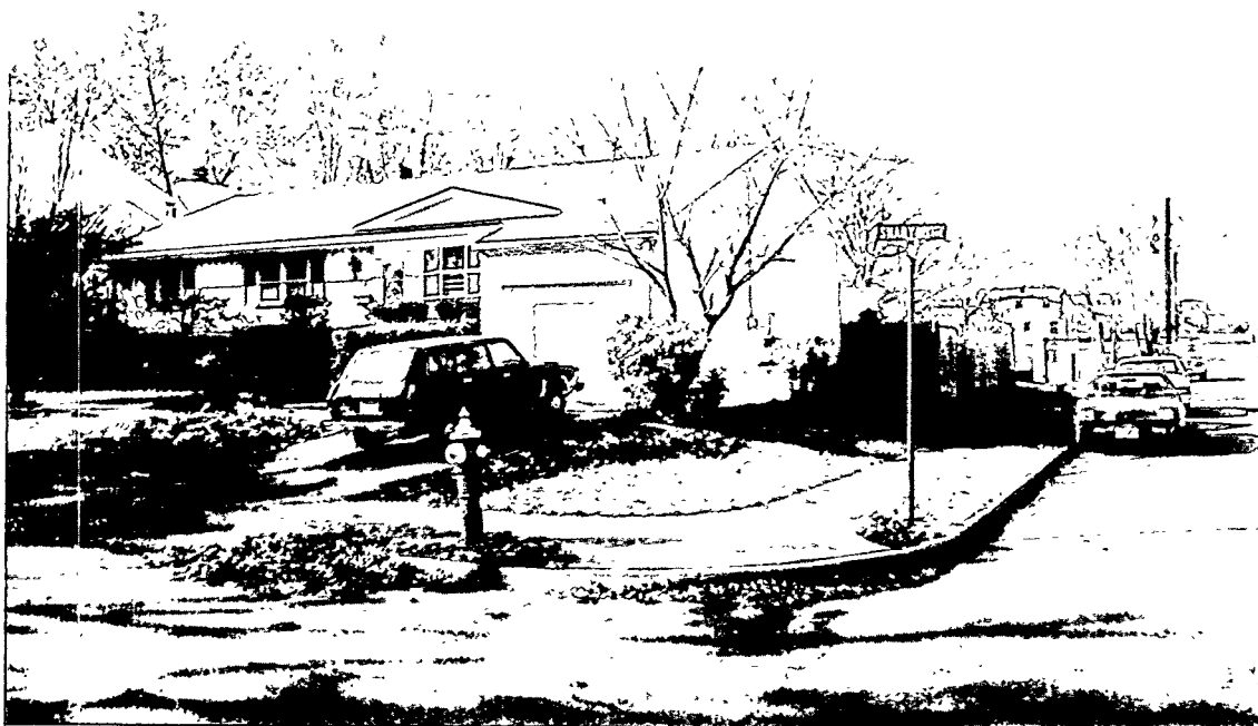
Fig. 3. Photograph of the property at 1 Shady Lane, Lodi, New Jersey facing north towards the front of the house.