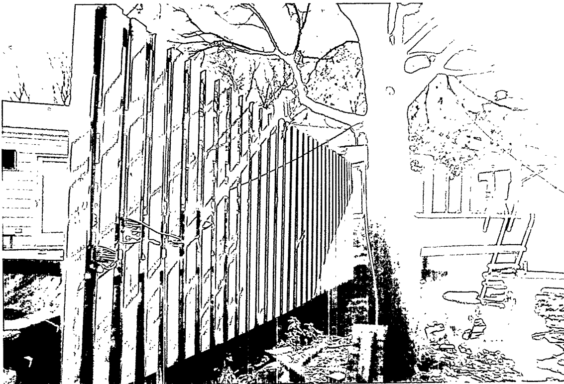
Fig. 5. Photo of the back yard facing the southwest end of the house at 1 Shady Lane, Lodi, New Jersey.