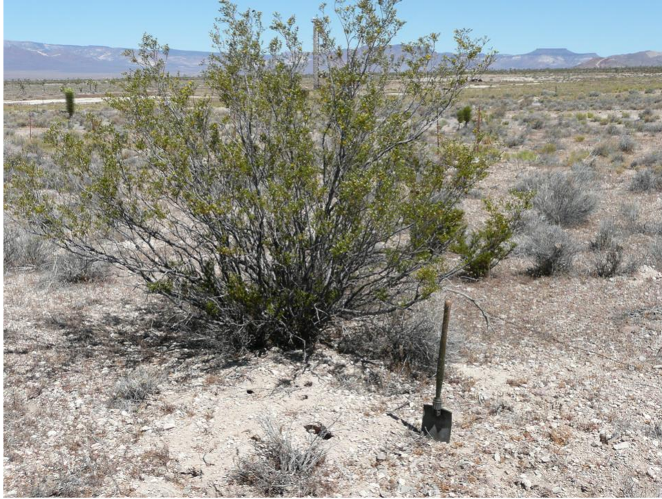
Fig. 2. Bioturbated shrub mound formed around a creosote bush ( Larrea tridentata ) on Yucca Flat on the Nevada Test Site. The photo was taken in June 2008.

detonation for more than 30 days. Much of the migration was attributed to a combination of saltation and soil creep in areas where vegetation cover existed that acted to shelter particles from distribution between higher-velocity wind events. Essington et al. [3] found shrub mounds covered between 15 and 30 percent of the area. In addition, mound types were identified based on the vegetation around which they developed. Major