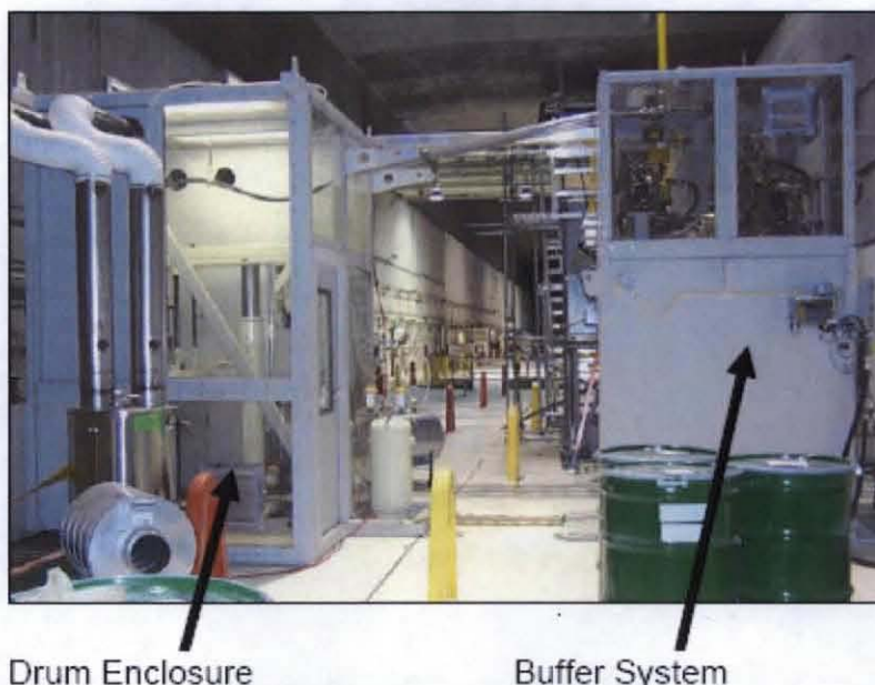
Fig. 3. The treatment system had several components (alternate view).

Enclosures to shield workers from radiation were used during sludge grout processing. Further, all exterior surfaces of the drums were covered with plastic to prevent the drums and shielding from becoming contaminated. The plastic did not interfere with the visual examination of the drums during filling and mixing operations. The drums were then lifted onto the drum conveyor system for transport to the enclosure (Figure 3).