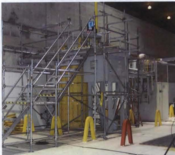
Fig. 2. A system for treating the NLOP sludge was set up in T Plant.

When the LDC was first placed on the floor of the T Plant canyon for treatment (Figure 2), the LDC was placed in an overpack and shielding was used to keep worker exposure as low as reasonably achievable (ALARA). The sludge was fluidized with water within the LDC and then transferred to the grouting system buffer tank (Figure 3) utilizing a suction wand to vacuum/transfer the slurry. A camera was used to verify the removal of sludge from an LDC. The design incorporated gamma dose measurements of the sludge at the buffer tank using an in-line gamma monitor mounted on the system. The amount of sludge added to each drum (which had been preloaded with the dry grout mixture) was determined based on a correlation between the gamma monitor reading and the volume of sludge so that, when grouted, the treated sludge would meet a contact dose rate of \leq 200 mrem/hr.