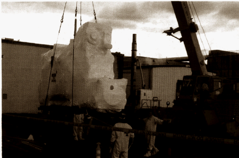
Figure 3. After the internal equipment was removed from the incinerator glovebox, the glovebox was packaged and removed from the facility to be size reduced at the Hanford size-reduction facility at T-Plant.

The glovebox was then decontaminated with the goal of cleaning the glovebox to LLW so it could be shipped whole to ERDF which is a CERCLA disposal site. While flat and accessible surfaces were decontaminated to LLW, penetrations and hidden surfaces could not be decontaminated. To minimize the impact on the project schedule, the transuranic glovebox was packaged and sent to the onsite Hanford size-reduction facility at T-Plant. Figure 3 shows the packaged glovebox.