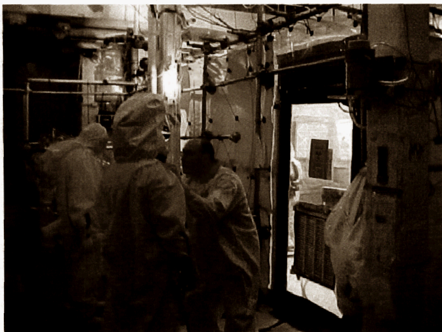
Figure 4 – Prior to entering the scrubber cell access tent, a final check of PPE is conducted and the fresh air breathing hose is attached. Monitoring of the airborne environment, conducting aggressive ash fixing processes and performing extensive checks on protective equipment resulted in 104 safe entries into the highly contaminated scrubber cell room.

With the glovebox removed, the team could enter the scrubber cell for the first time in 15 years. Figure 4 shows the team preparing to enter the scrubber cell. The ability to characterize the scrubber cell from the outside was very limited, so substantial controls such as tenting, additional filtered ventilation exhausters, fresh airline protective clothing, and extensive air monitoring were in place prior to the first entry. The opening of the scrubber cell door showed that disturbing any surface inside the cell could result in significant airborne contamination of over one million derived air concentration hours. The cell was sprayed with a fixative prior to the initial entry and then routinely fogged to ensure surfaces were wetted during future entries.