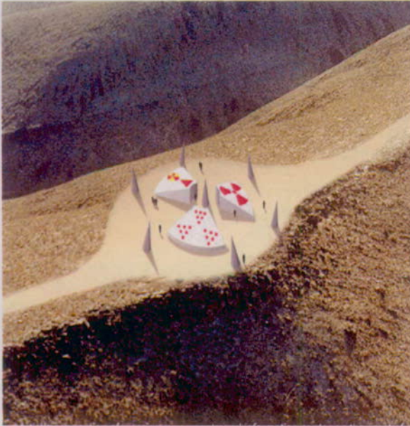
Artist's conception of one of the large warning monuments that also serve as information centers on the crest of Yucca Mountain after permanent closure of the proposed geologic repository.