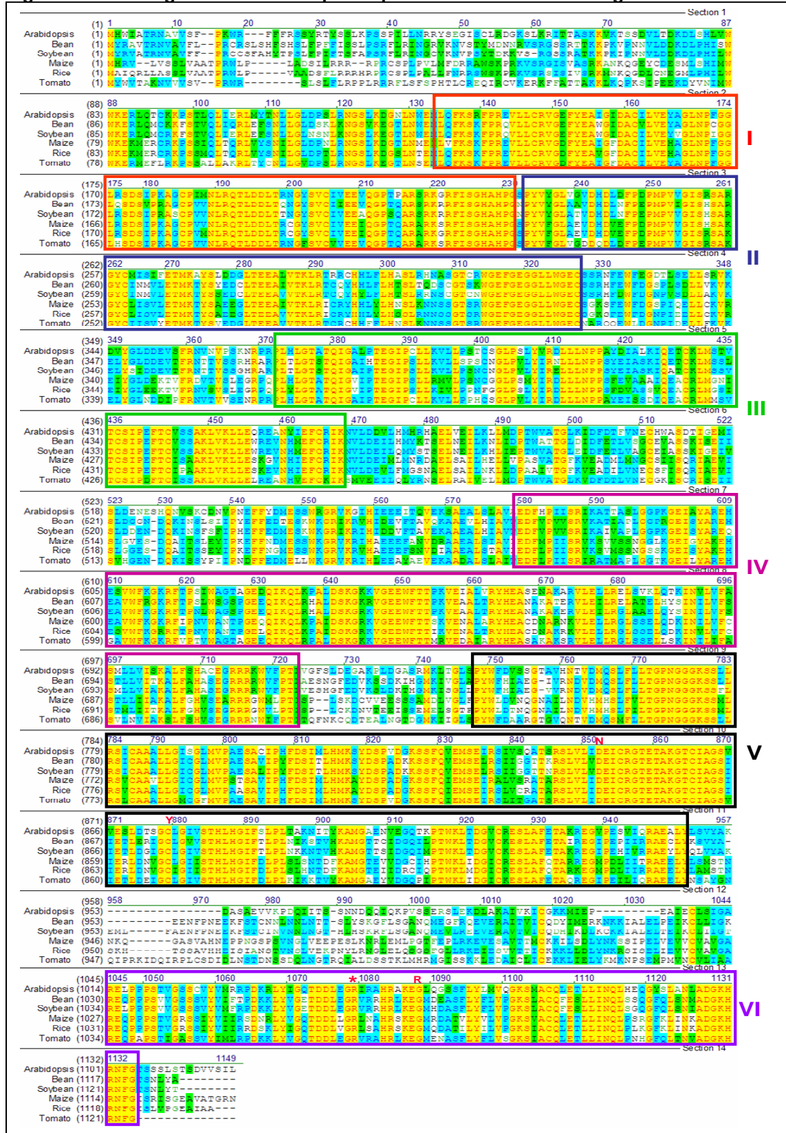
Figure 1. MSH1 alignments from six plant species reveals six distinct gene domains.