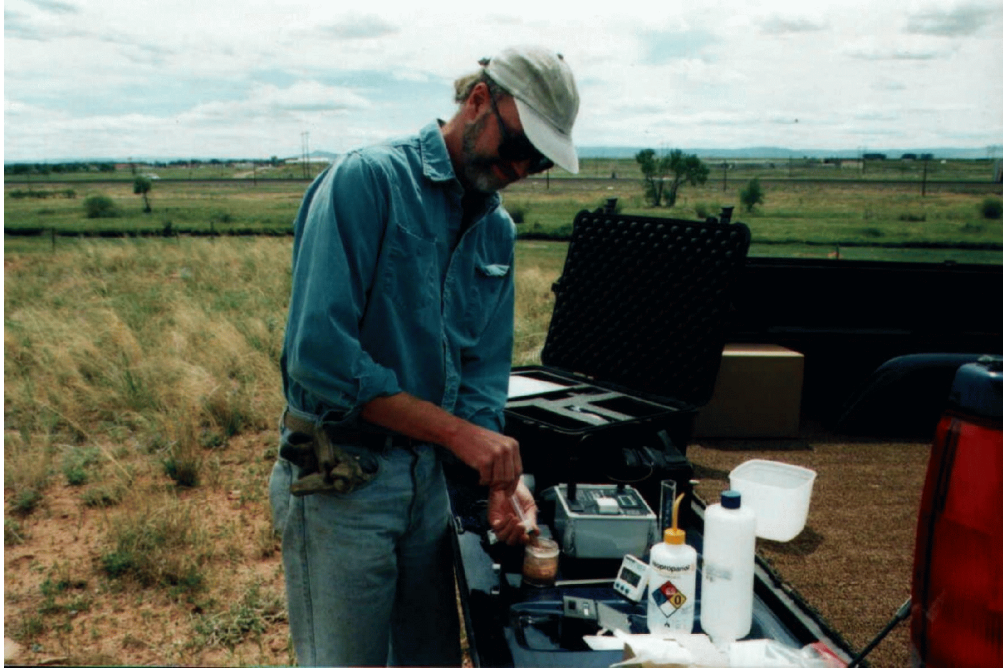
Figure 2. Diesel Dog Soil Test Kit Field Use