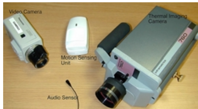
Figure 2. Typical surveillance equipment.

Many types of sensor technologies are currently available for surveillance applications. These include video cameras, acoustic sensors, thermal imaging cameras, as well as motion sensing units (Figure 2). The electromagnetic pulses (EMPs) produced during charge cycles in this application must be taken into consideration in all monitoring system designs. Additionally, because the capacitor bank has been designed to “float” relative to the building ground, the module frames may be at a 10 kV potential in certain load configurations. In order to ensure that the sensors themselves do not increase the likelihood of a fault, their placement must not be in direct contact with any equipment within the room and their signal and power lines must be isolated from power lines within the capacitor bank room.