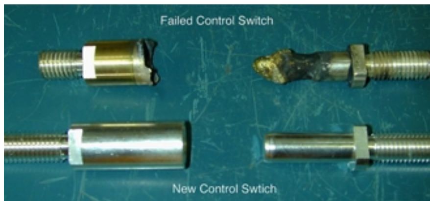
Figure 1. Example capacitor bank switch failure (switches provided by Multi-Contact USA).

The PIR detectors and the cameras have been able to detect and record transient arc events occurring within the room. These arc events are produced by capacitor bank equipment faults and destructive failures during normal operations. Previously, the equipment faults [2] had not been detectable until a destructive equipment failure occurred (Figure 1). Analysis of the AST data shows evidence that destructive failures follow several precursor events of lesser magnitude.