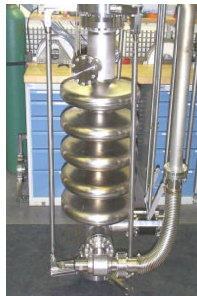
Figure 1: APT 5-cell cavity set on the cryostat insert.

Note: the values in the parentheses are for LANL and AES cavities.