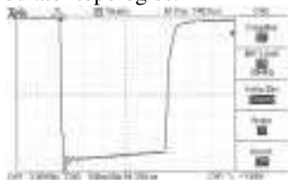
Figure 2: 140 kV Output Pulse, 20 kV/Division

The converter-modulator made its first high voltage pulse on January 17, 2001. After 10 days of testing and replacement of defective dummy load components, full pulse output voltage (140 kV), pulse width (~1.2 ms), and peak power (11 MW) were obtained. As shown in Figure 2, the 140 kV risetime is about 20 \mu s with about a 6% bank droop. The risetime compares favorably to other long-pulse modulator topologies.