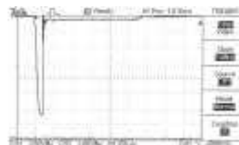
Figure 6: 130 kV Run-On Fault Test