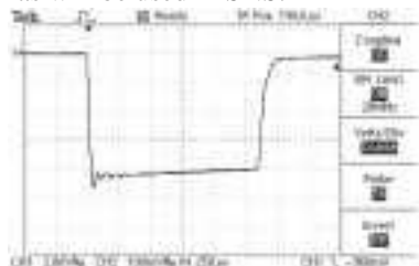
Figure 3: 80 kV Output Pulse, 20 kV/Division

Additional high-voltage tests were made at 80 kV, as this voltage will be used in the SNS linac superconducting portion. The 80 kV operations are shown in Figure 3. 80 kV operations with the DSP adaptive feedforward/feedback processor is shown in Figure 4. The DSP processor removes all overshoot and bank voltage droop. Extensive fault testing has also been performed with three times the anticipated high-voltage cable length as will be used in SNS.