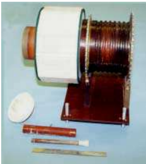
Fig. 3. VNIIEF MC-1 High Magnetic field generator. The two inner cascades and a 30 cm ruler are in the foreground.

used in the development of the MC-1 devices. Experiments were required to ascertain that the higher energy HE would actually enhance performance, since the MC-1 was optimized for the other HE. The MC-1 operates by injecting magnetic field, via current from a capacitor bank, through a solenoid consisting of fine wires cast into a plastic. Once the field is established inside the generator, the HE shocks the solenoid, which fuses into a conducting cylinder and implodes, compressing the field. At the position where the cylinder begins to become unstable, it collides with a second cylinder similarly constructed. Again, the field penetrates the non-conducting matrix, but the shock wave causes the cylinder to conduct, trapping the field and further compressing it. For the highest fields, a third cascade is used, and experiments are conducted in a few cubic millimeter volume along the axis of the device. Los Alamos scientists first became aware of this system at the MG-5 conference. 3