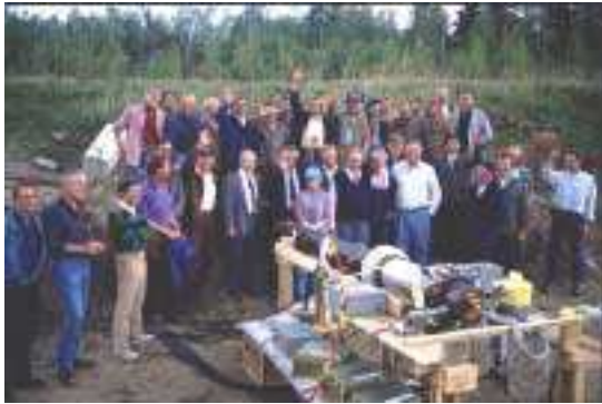
Fig. 5. Group photo of 1996 MAGO test at VNIIEF. The system consists of a helical generator, a storage inductor and opening switch, and a plasma chamber, which is nearest the camera.

The concepts involved in the MTF schemes we have worked on in this collaboration require considerable explanation, and a detailed description is beyond the scope of this paper. A good description is given in ref.1. For this paper, we picture the primary experimental apparatus in fig. 5. The system uses a helical explosive generator to amplify current from a capacitor bank and deliver some of the magnetic field to a plasma chamber and the rest to a storage inductor. An explosive-opening switch then produces a voltage spike (necessary to the plasma formation) and subsequently causes current from the storage inductor to be transferred to the plasma chamber. Peak current in the load- during the experiment is about 8