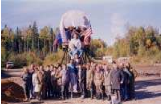
Figure 2. Group photo of the first test of the collaboration, Sept. 1993 at VNIIEF.