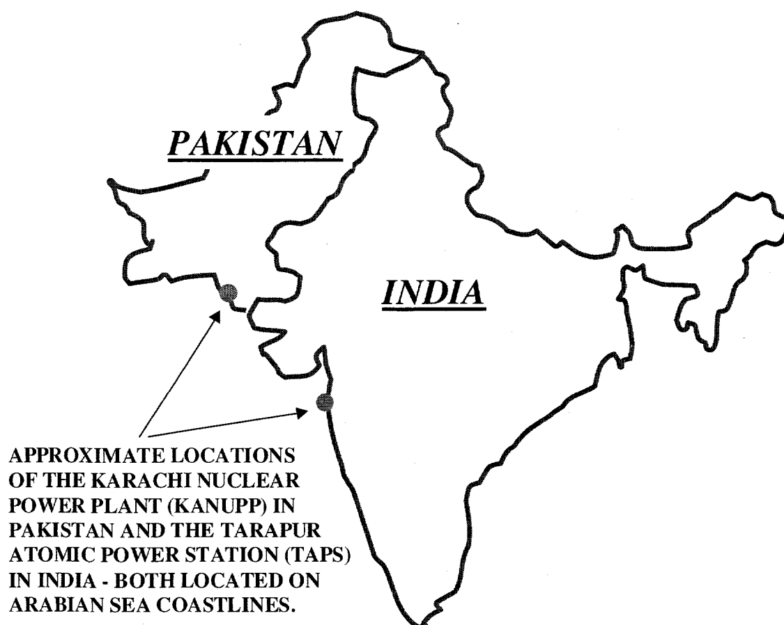
Figure 2: Approximate locations of the TAPS and KANUPP nuclear facilities.

One of the key elements of the South Asian Seas Action Plan is to encourage collaboration among regional scientists and technicians and their institutions through the "establishment of a coordinated regional marine pollution monitoring program, based on intercomparable methods, for the study of the various processes occurring in the coastal areas and open ocean of the region and the assessment of the sources and levels of pollutants and their effects on marine life and human health" (Rajen, 1999). The UNCLOS has specific provisions relating to the prevention, reduction, and control of marine pollution from land-based activities. In keeping with these provisions, Annex IV of the South Asian Seas Action Plan includes a "Regional Program of Action for the Protection of the Marine Environment of the South Asian Seas from Land-based Activities." The proposed activities include the "Development of a Regional Program for Monitoring of Marine Pollution in the Coastal Waters of the South Asian Seas and the Regular Exchange of Relevant Data and Information."