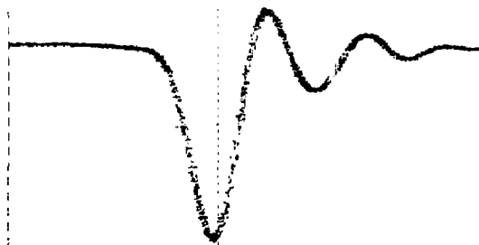
Fig. 3 The single S-band bunch Accelerator Gap monitor signal viewed with 56 dB attenuation on a digitizer sampling scope. (Accelerator Gap calibration is 10 V/A.) Scope settings: 200 ps/div and 20 MV/div.