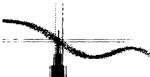
Fig. 4. Gun Gap signal leading edge of Fig. 2, expanded for time jitter measurement. Scope settings: 50 ps/div and 10 MV/div. Timing jitter sigma = 12.1 ps.

The measurement at both monitors was done by expanding the leading edge of the beam gap monitor signal and collecting one hundred samples of timing values within a small voltage window of the signal. The jitter at the Gun Gap was measured to have a \sigma = 12.1 ps, as shown in Fig. 4; the jitter at the Accelerator Gap was measured to have a \sigma = 8.7 ps, as shown in Fig. 5. The Accelerator Gap measurement is almost certainly a measurement of the scope time resolution. Subtracting in quadrature the measured resolution from the Gun Gap jitter results in \sigma = 8.4 ps.