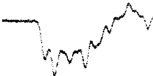
Fig. 2 The full, unbunched Gun Gap monitor signal viewed with 63 dB attenuation on a digitizer sampling scope. (Gun Gap calibration is 10 V/A.) Scope settings: 500 ps/div and 10 MV/div.

The reason beam timing jitter is of concern at the SLC is that any timing change of the beam relative to the accelerating S-band phase results in a beam energy change. Thus, beam