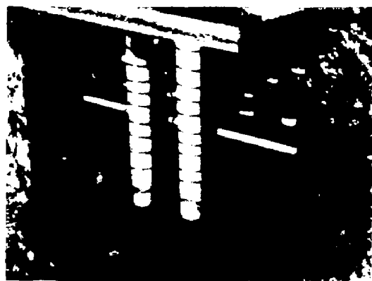
Fig. 2 Absorber and heat sink of 8 kW Faraday cup

The beam stoppers for the two locations are identical with the exception of two features. The absorber block in ST4 is electrically insulated by a 12.7-mm-thick ceramic plate ( \text{Al}_2\text{O}_3 , 99% pure). This allows it to also be used as a crude Faraday cup for measurement of average charge delivered to the IP. Relative current measuring devices such as toroidal current transformers can be calibrated against ST4. The second feature is a luminescent beam profile monitor screen mounted to both ends of the absorber which allow visual monitoring of the parked beam. Figure 2 shows an absorber block, insulator and heat sink assembly. The absorber block is housed in a vacuum chamber and can be remotely inserted (pneumatically) to block the beam passage. The heat is conducted across the insulator to a water-cooled plate. Water is brought into and out of the vacuum system in a stainless steel manifold free of any water-to-vacuum joints. The nominal flow rate is \sim 0.2 l/s and the steady state bulk temperature rise for P_{\text{avg}} = 8 kW is \sim 10^\circ\text{C} .