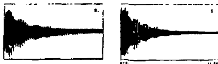
Fig. 1. Comparison of experimental measurement with the calculation using the two-particle model. Figure shows the center-of-charge response to a single kicker excitation as seen by an electrode pick-up. The beam current is 12 mA. The other parameters are \nu_\beta = 18.10 , \nu_s = .044 , and K/K_{\text{threshold}} = 0.77 .

In Figs. 1(b), 2(b) and 3(b) we show the results of a computer simulation for the two-particle model described above. The quantity plotted is the center-of-charge signal of the two-particle beam sampled every revolution for several values of the coupling parameter K as K approaches threshold. Figure 4 shows the spectrum of the two-particle motion when K = 0.988 ,