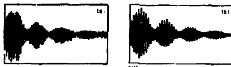
Fig. 2. Same as Fig. 1, but with beam current increased to 13 mA and K/K_{\text{threshold}} = 0.90 .