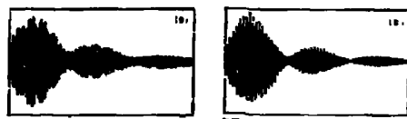
Fig. 3. Same as Fig. 1, but with beam current increased to 13.8 mA and K/K_{\text{threshold}} = 0.99 . The threshold current is 14 mA.