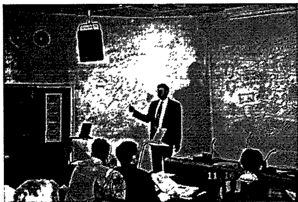
Fig. 2. MPC&A Training Class in Progress

Throughout the 29 ITC lecture sessions, simple, but consistent examples and problems are used to move the participants through the cognitive levels of knowledge, comprehension, application, and analysis. Figure 2 shows a typical training session. To progress from the analysis to synthesis level, a hypothetical facility is introduced and gradually developed into a final exercise. The final exercise requires the participants to analyze the situation, sort through the information provided, and differentiate between the good and bad aspects of the existing design. As a final step in the exercise, ITC participants infer modifications that will improve the physical protection system of the exercise facility.