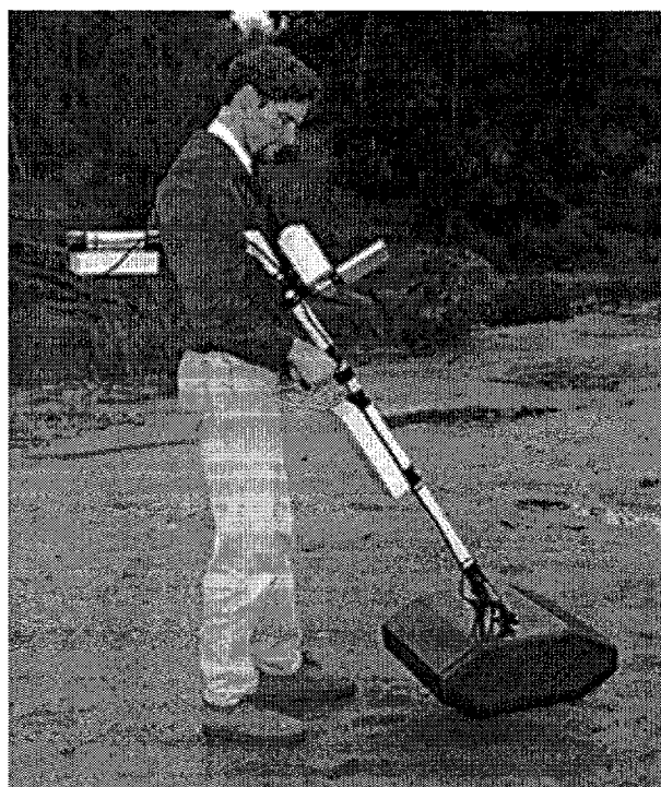
Figure 2. GPX-X being tested.

The GPR-X has a simple interface with only two radar adjustments: a linear "scale" and exponential "range gain." Real-time algorithms can be implemented on the data because of the system architecture and on-board