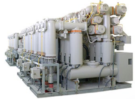
Figure 1. Gas-insulated switchgear, source: Fuji Electric Global.

Another alternative is to use a gas to insulate the mechanism (Figure 1). Starting in the 1960s, this became a popular solution due to the desirable electrical properties of \text{SF}_6 gas. Compared to OCBs, GIEs require significantly less maintenance and are much safer to operate. However, the primary advantage of GIEs is their reduced footprint, roughly 1/10 of air-insulated equivalents. This makes these systems particularly popular in interconnections with high population densities. They are also popular in regions with harsh climates because they allow an entire substation to be contained in a climate-controlled structure. In the U.S., between 2 and 5% of all new substations are gas insulated (Parnell 2024).