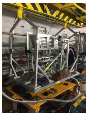
High density nanofiber

All samples have been sent to Pacific Northwest National Laboratory, USA, and Material Research Facility, Culham-UK, for further Post Irradiation Examination (PIE). The results will greatly improve our knowledge of thermal shock behavior in target materials and will guide for more robust design of next-generation accelerator target systems. All the results obtained during these 3 experiments benefit the different RaDIATE collaborators around the world.