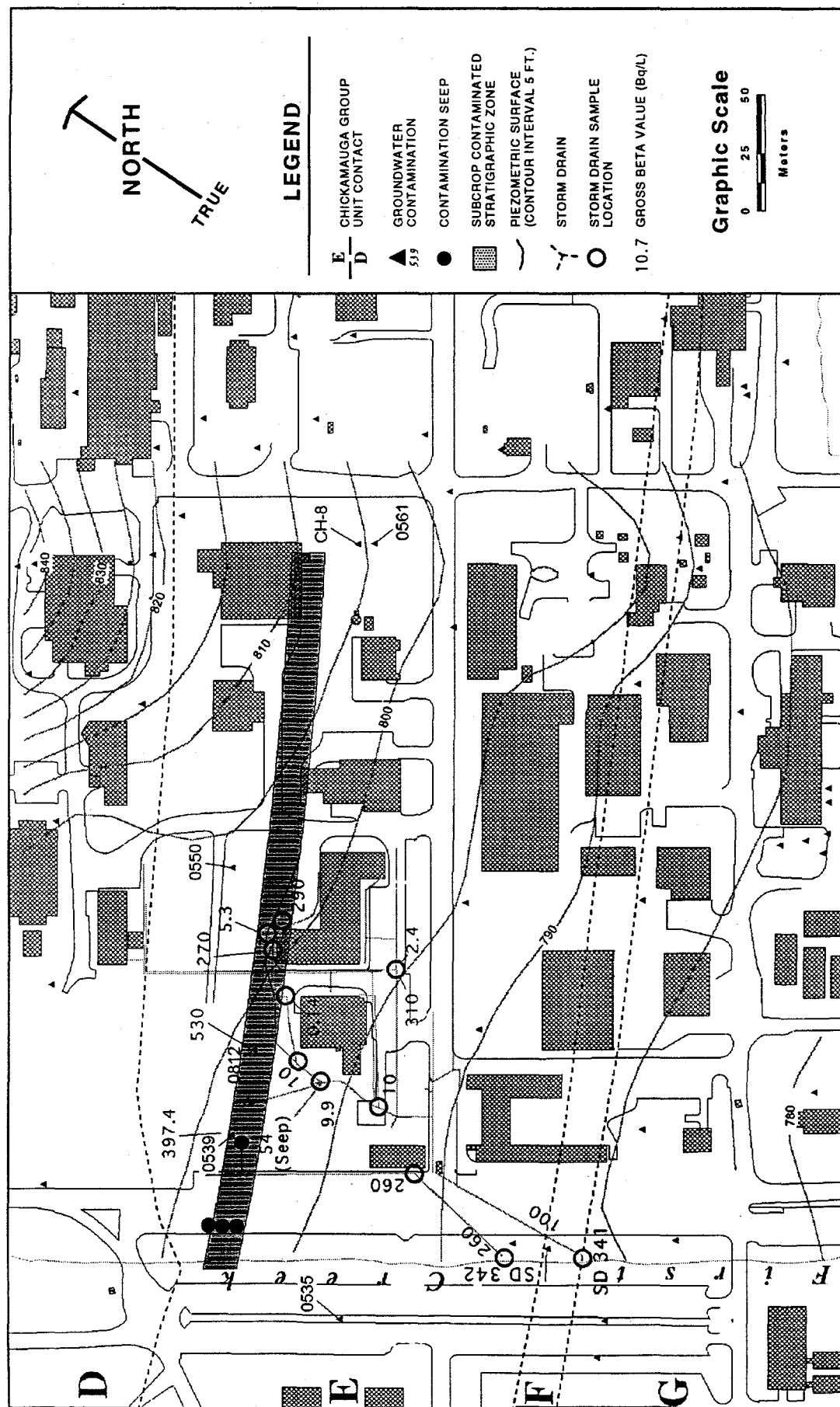
Figure 3. Hydrologic Sampling Results in the Plume, Storm Drain Catchment Basins, and Outfalls.