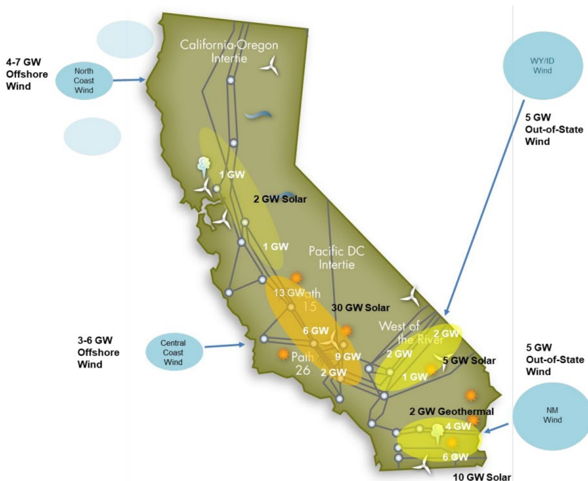
Figure 3 Resource areas and interregional connections in CAISO's 20-year plan (CAISO 2022a)