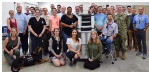
Figure 2 Participants of the NAD inter-comparison exercise.

This work was supported by the Nuclear Criticality Safety Program, funded and managed by the National Nuclear Security Administration for the Department of Energy. This work was performed under the auspices of the U.S. Department of Energy by Lawrence Livermore National Laboratory under Contract No DE-AC52-07NA27344. The U.S. Department of Energy's Nuclear Criticality Safety Programs National Criticality Experiments Research Center, utilized in this work, is supported by the National Nuclear Security Administration's Office of the Chief of Defense Nuclear Safety, NA-511. Thank you to everyone that has participated in this exercise (see Figure 2).