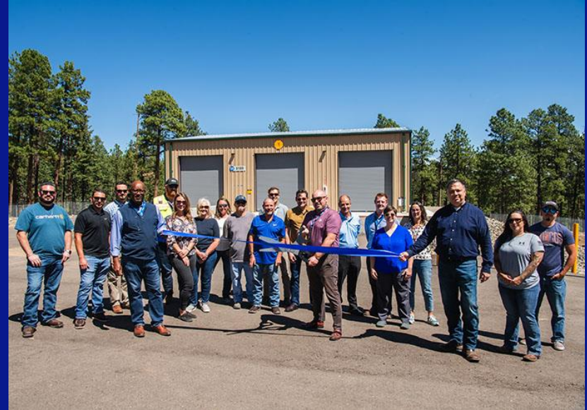
HETF Ribbon Cutting

September ribbon cutting with members of LANL team from Engineering, Project Management, ALDICP and WFO