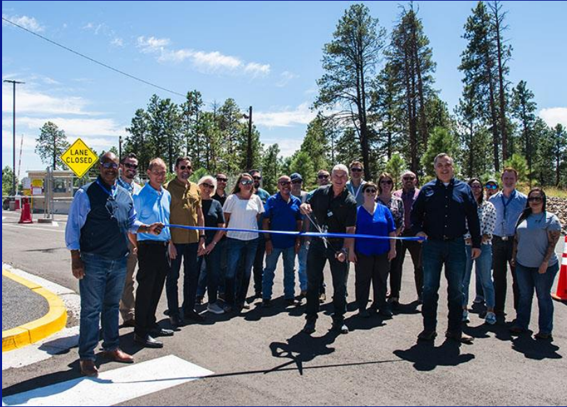
VAP Ribbon Cutting