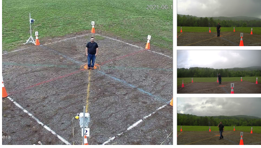
Figure 3: Close-range station example from BGC1. The image on the left is a single frame collected from an elevated surveillance camera. The images on the right are frames from the standing and walking portions of the subject collection viewed from ground-level cameras.

erated simultaneously during the collection and were typically separated at a range of altitudes and distances from the collection box. Flight time was an important consideration for the platforms; whereas larger aircraft could operate for hours at a time, the smaller quadcopters needed to be swapped every few subjects to change batteries. Keeping all aircraft operating proved to be very challenging due to frequent issues with battery swaps, maintenance, and weather.