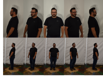
Figure 2: Controlled collection image example of a subject. The top row contains the five neutral face still images. The bottom row displays five of the eight collected angles for standing, WB still images.