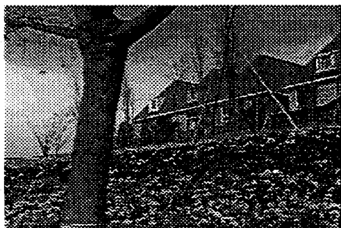
Figure 2. Flower Garden Image

We tested our parallel MPEG decoder for two standard video sequences: “flower garden” (Figure 2) and “tennis” (Figure 3). The testing result are summarized in Table 1. Note that the time is an approximation based on a segment containing GOPs with six frames. The testing was conducted in the system environment described in Section 3.