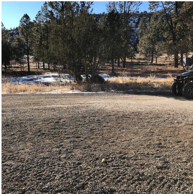
Figure 4. Proposed Location #3 for a Storage Unit North of East Jemez Rd. Looking South.