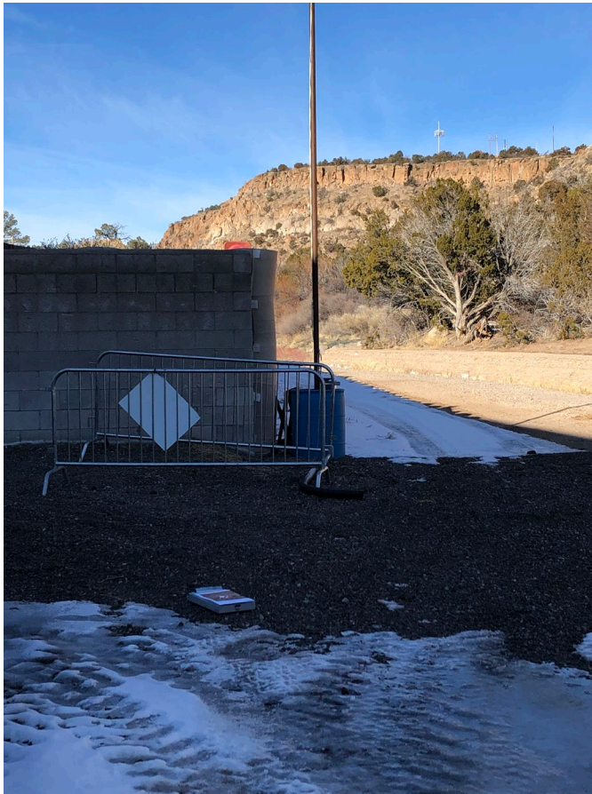
Figure 3. Proposed Location #2 for Storage Units North of Building 72-0036 Looking West.