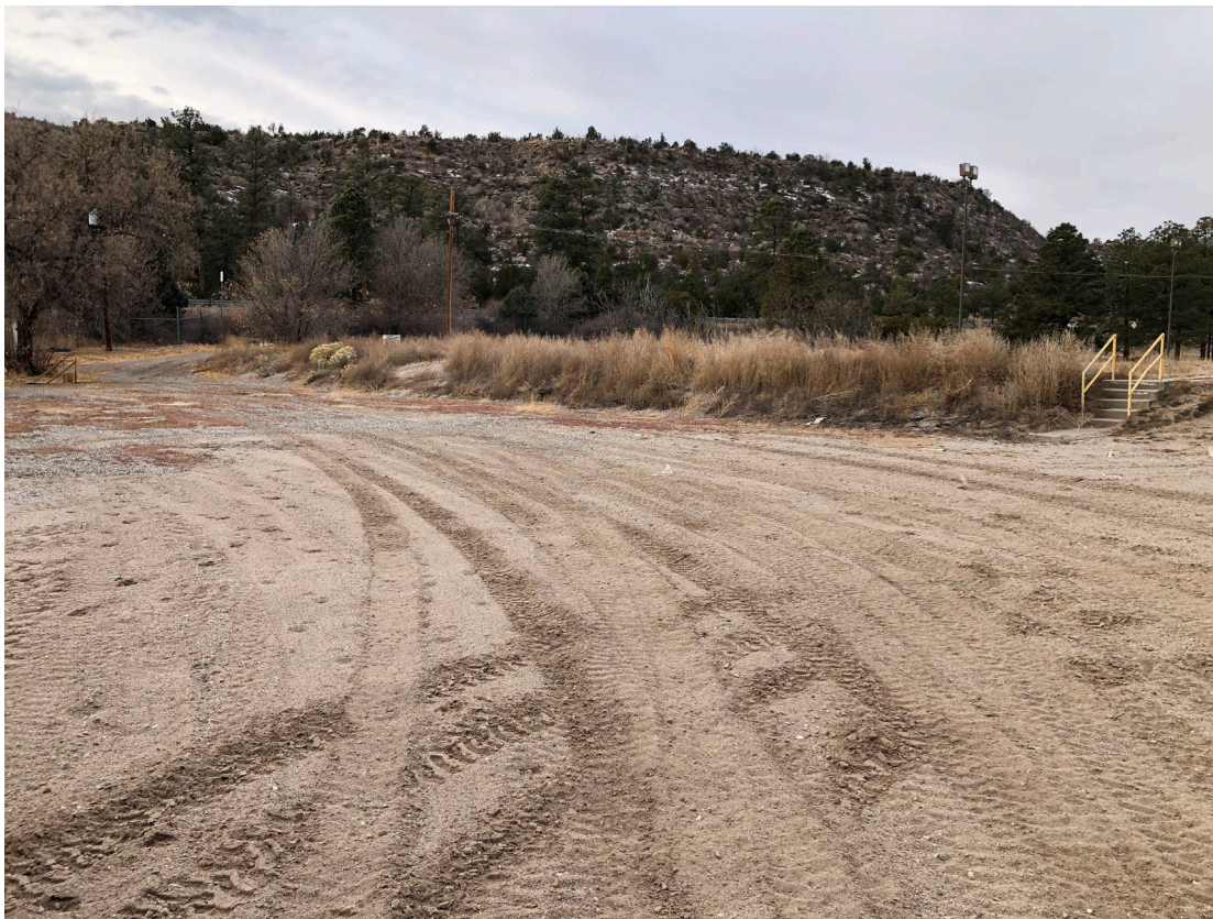
Figure 2. Proposed Location #1 for Storage Units East of Building 72-0036 Looking South.

Location #3, to the east of the main buildings, is part of an area that underwent upgrades in 2018 (Figure 4) (LANL 2018). The additional firing ranges and associated access roads were stabilized with asphalt millings. One 8 ft. by 40 ft. storage unit would be placed directly onto the existing asphalt millings. An additional storage unit may be placed in this area in the future as needed by the facility.