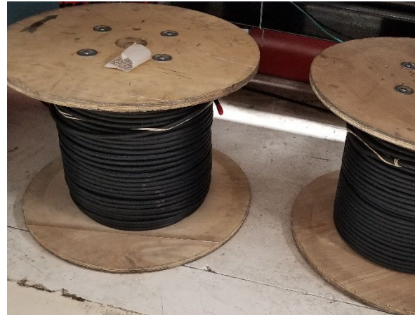
Figure 5 Shielded and Unshielded cable spools

The ARENA test bed is also a simple system that can be modeled and simulated as a digital twin so observed instrument behavior may be better understood and alternate environmental or material degradations may be virtually evaluated where applicable.