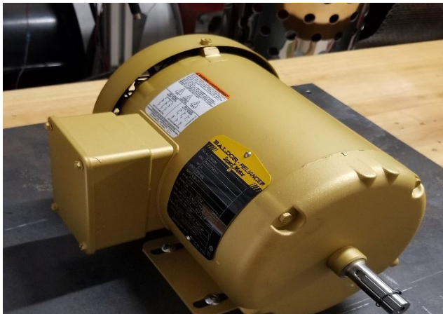
Figure 4 ARENA 480 VAC 3 Phase ½ HP Motor

By contrast, the ARENA test bed environment offers opportunities to introduce controlled component damage while monitoring the instrument response and without risking safety critical components. These faults can be introduced, and responses captured relatively quickly compared to an on-site setup thereby allowing a large number of failure types to be tested.