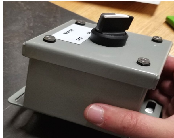
Figure 3 Remote Control Pendant