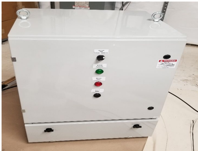
Figure 2 AREVA motor control cabinet