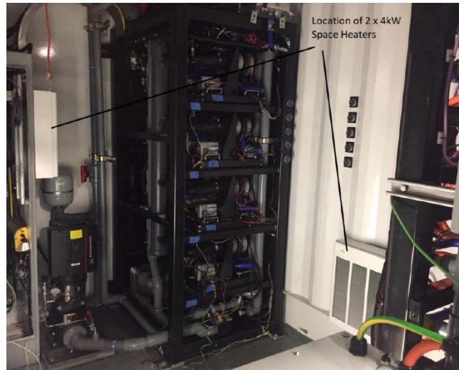
Figure 3: System heaters and controls which were installed to allow the MarFC to operate in weather down to -25 degrees C in anticipation of a future deployment in cold weather.