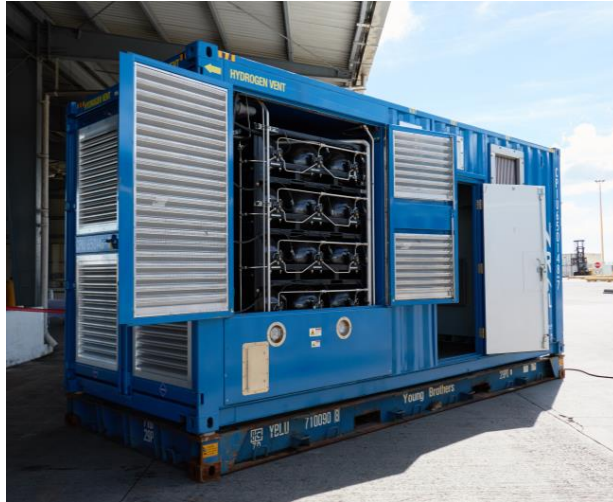
Figure 1: The 100-kW maritime fuel cell generator (MarFC), with integrated hydrogen storage, PEM fuel cell power generation, and power conditioning equipment.