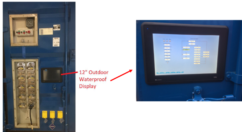
Figure 2: Installation of a ruggedized system display, making it easy for the operator to ascertain the state of the MarFC, especially during start-up.