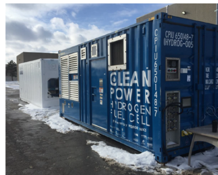
Figure 4: (L) Indoor testing of the MarFC unit at Hydrogenics after system repair and upgrade; (R) Outdoor testing of the MarFC unit in cold weather at the Hydrogenics site in Mississauga, Ontario, Canada, December 2017.