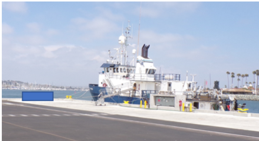
Figure 6: The SIO research vessel Robert Gordon Sproul, in port at the Nimitz Marine Facility of the SIO, San Diego CA. The blue box notionally indicates the future deployment and location of the MarFC.