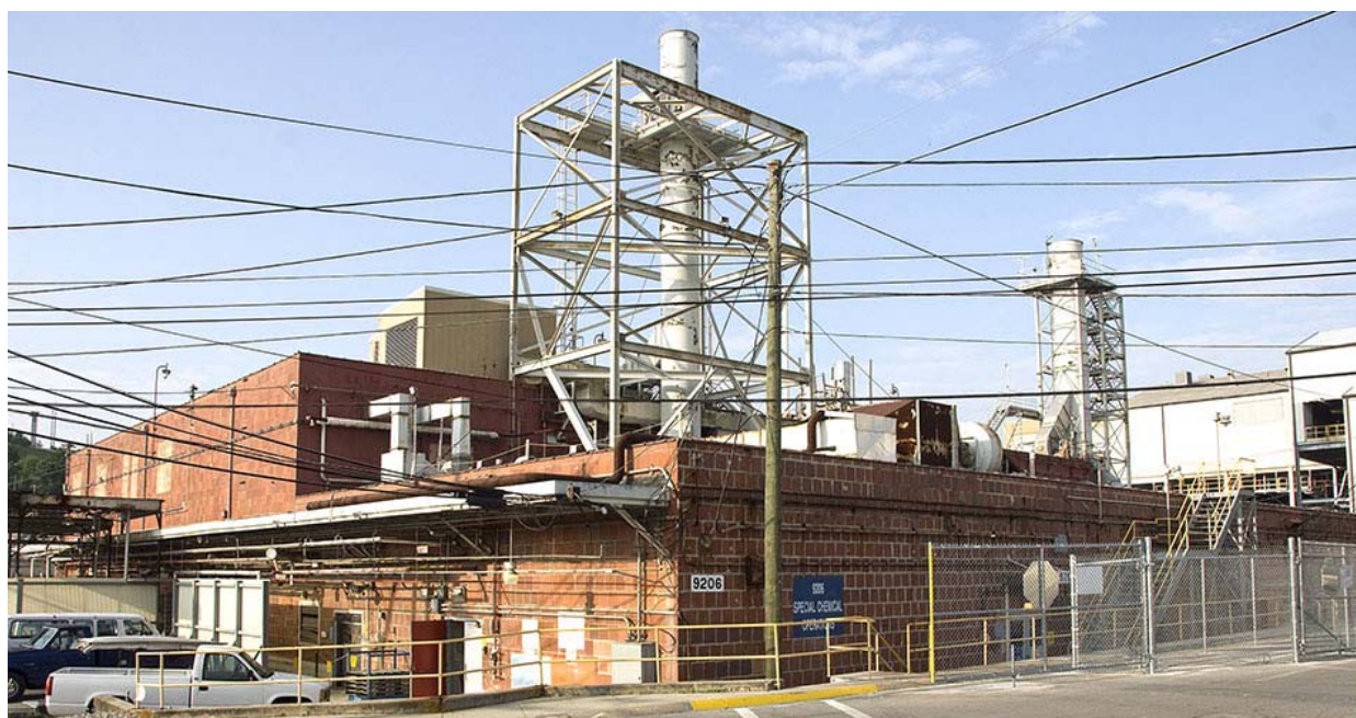
Figure 1. Building 9206

Building 9206, pictured in Figure 1, contains approximately 65,000 gross square feet of floor space. Over the years, Building 9206 housed processes and operations for chemical recycle, charge preparation, highly enriched uranium (HEU) recovery, and enriched uranium (EU) product processing. Most of the uranium that ended up being used in the “Little Boy” atomic bomb was processed in Building 9206. Feed preparation and product processing continued in Building 9206 through 1947, and uranium recovery and reclamation continued through 1951. By 1945 however, most of the building’s originally intended processes were being performed in a larger, sister facility—Building 9212. The purpose of Building 9206 began to shift once Building 9212 became operational after the end of World War II (WWII).