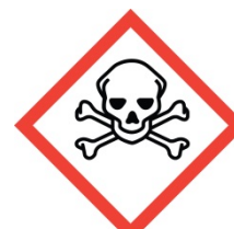
Agent, if present as neat materials