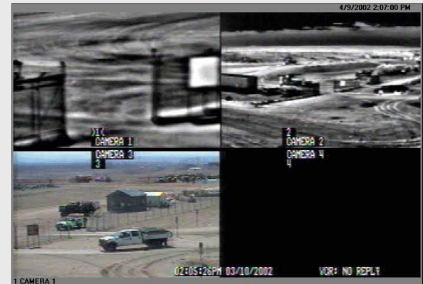
Outdoor Test Facility for Border Monitoring