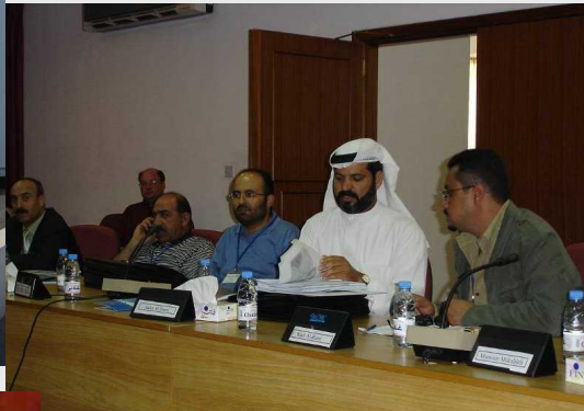
Iraqi Border Security workshop