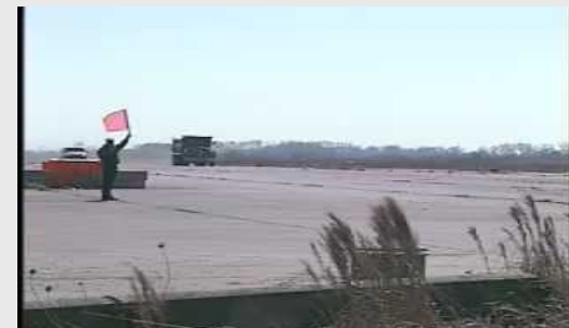
Physical Security Test Beds