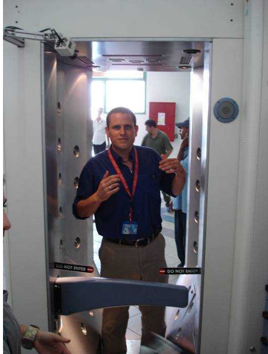
Israeli security officer demonstrates explosives detection portal to Jordanians at the Israel/Jordan border (September 2005)