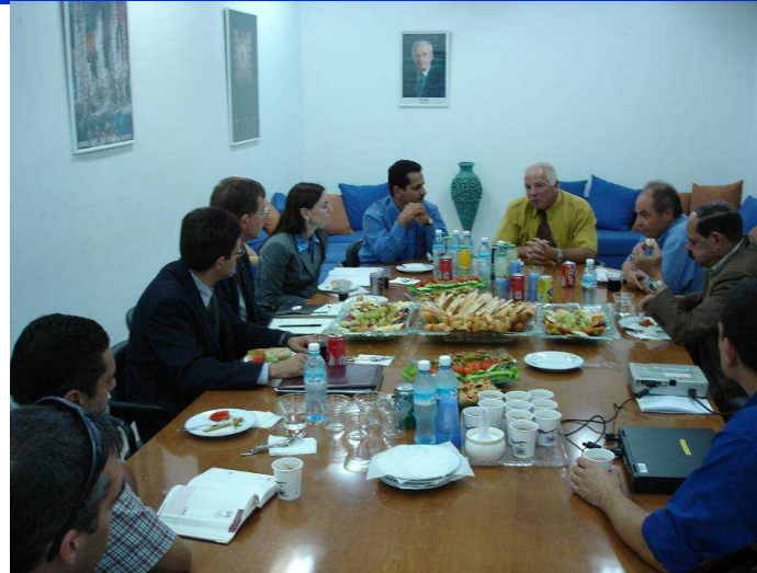
Israeli officials host US and Jordanian visitors for discussions on the use of the explosive detection portal (September 2005)