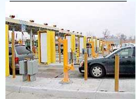
Vehicle Inspection Technologies