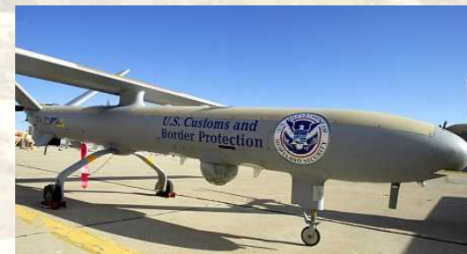
CBP Hermes 450 UAV