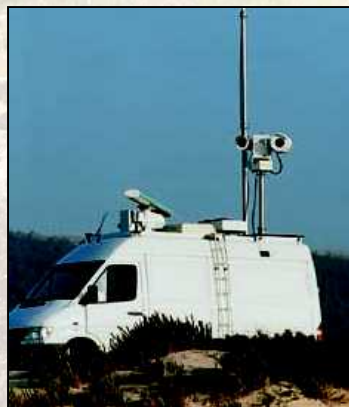
Mobile Sensor Platforms