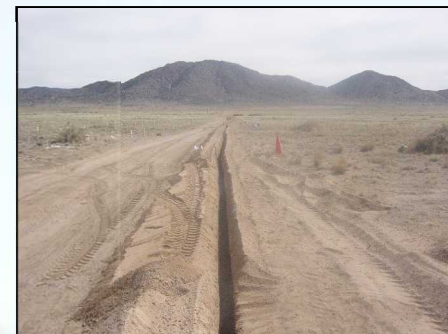
Buried Fiber Optic Sensors