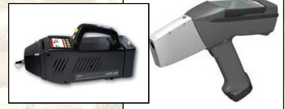
Handheld Contraband Detection Equipment