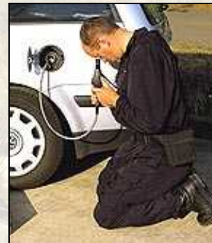
Fiber Optic Inspection Tools