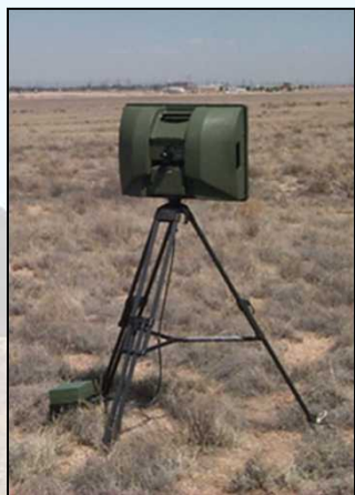
Portable Ground Radars