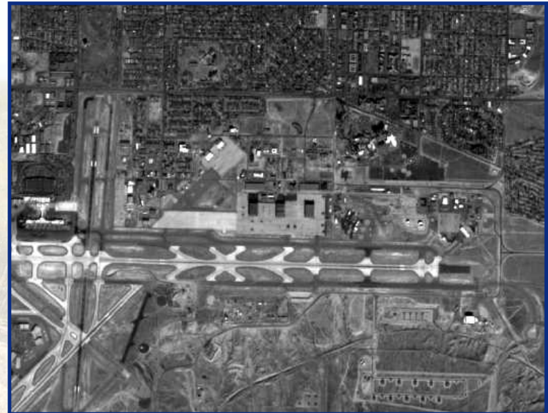
Indian IRS 1-C Satellite Image