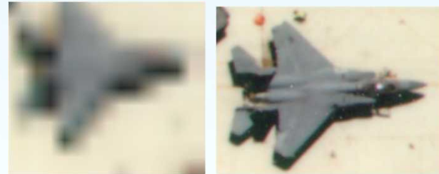
Identification of aircraft at varying resolutions