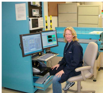
Pulsed High-Voltage System

The AC Project of the Primary Standards Laboratory maintains a wide variety of ac and pulsed electrical measurement capabilities to provide NIST-traceable measurements for Sandia National Laboratories, the Nuclear Weapons Complex, and Work for Others customers. Metrology resources include high accuracy ac current and voltage measurement systems to quantify component ac-dc difference, unique pulsed high-voltage generation and measurement capability to certify resistive and capacitive voltage dividers, and time and frequency measurements using a NIST designed GPS system. In addition to these capabilities, the AC Project team has responsibility for the certification of waveform Measurement and Test Equipment (M&TE) utilizing our precision voltage, current, and frequency reference sources.