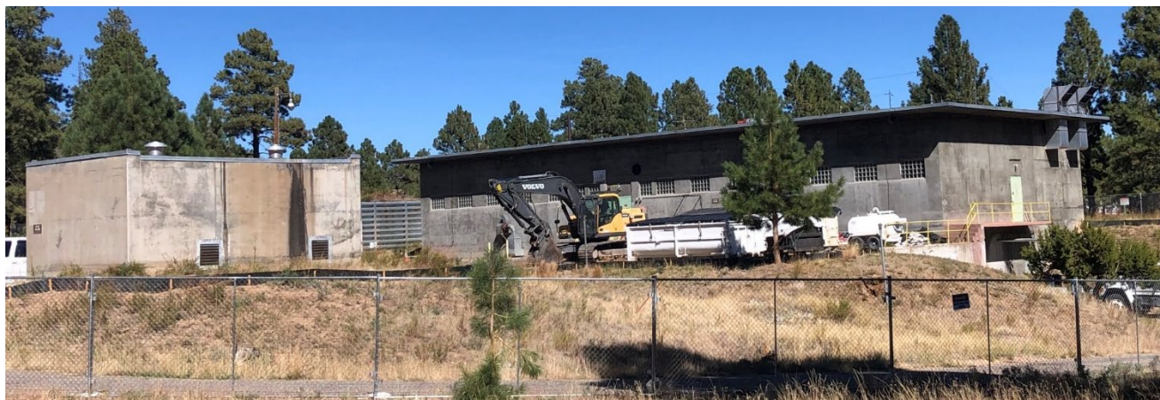
Building Exterior; Pre Demolition