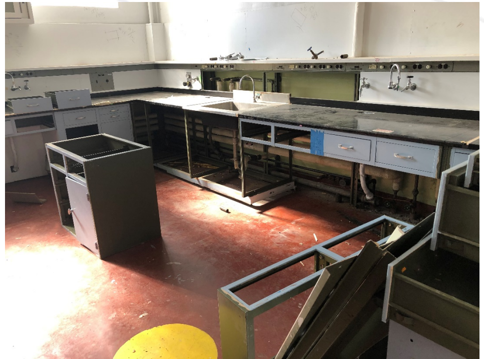
Building 460 Remediation – Room 113