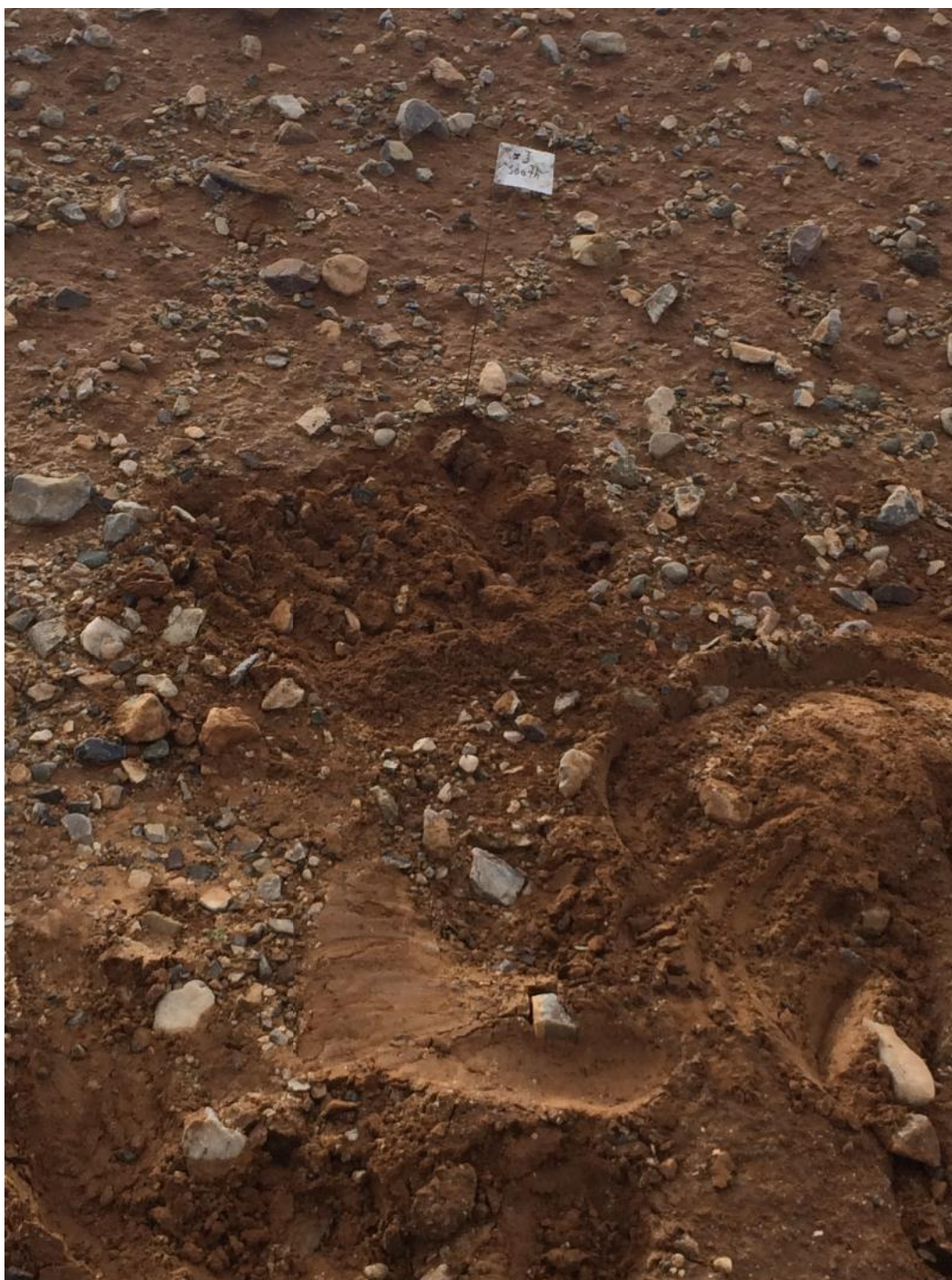
Figure 4. Location of Samples TTU-3 and TTU-3 dup

The samples were collected from 0-6 inch depth in the disturbed area at the base of the marker flag on the inside face of the south berm