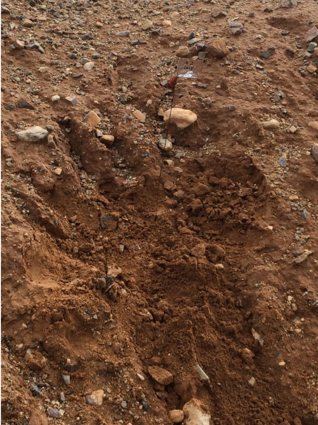
Figure 3. Location of Sample TTU-2

The sample was collected from 0-6 inch depth in the disturbed area at the base of the marker flag on the inside face of the east berm.