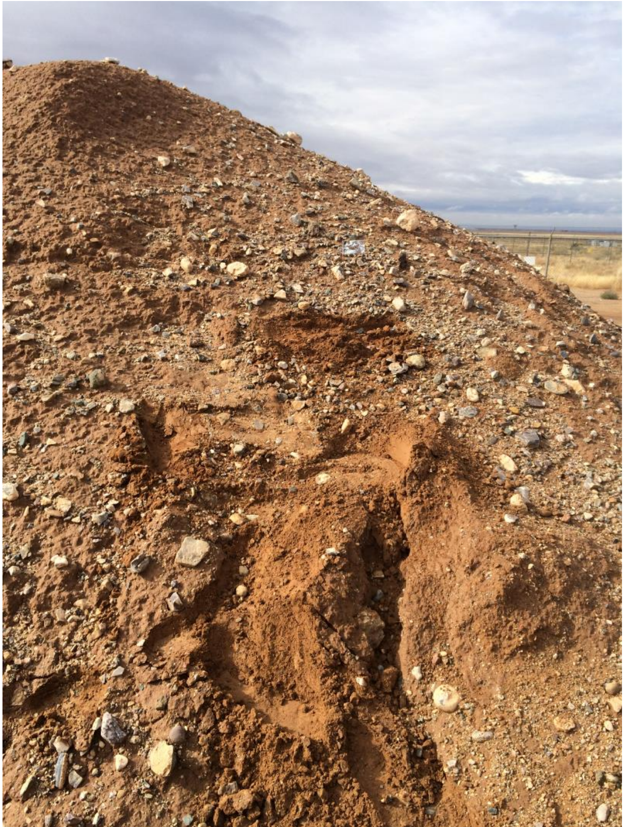
Figure 5. Location of Sample TTU-4

The sample was collected from 0-6 inch depth in the disturbed areas on the inside face of the west berm.