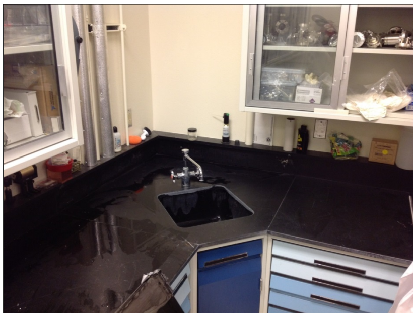
Photo Number 2. Sink and work area following decontamination. The surface of the work table has been cleaned but is not yet dry. The platform has been removed and placed against the cabinet for cleaning; the corner of the platform is visible at the bottom of the photograph, to the left of the sink.