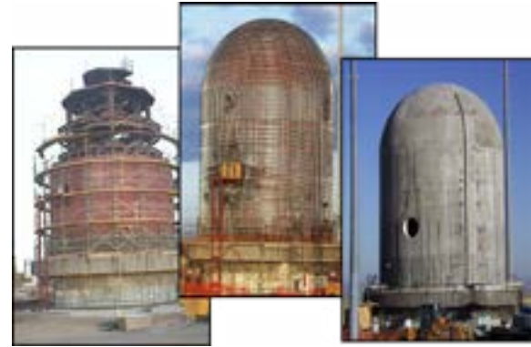
Quarter-scale containment is the largest nuclear reactor containment vessel model ever tested

Sandia constructed the largest and most comprehensively instrumented scaled nuclear reactor containment vessel ever tested, and hosts numerous on-site experimental facilities including a rocket sled track for testing high-velocity impacts, shock thermodynamics research lab, modal and