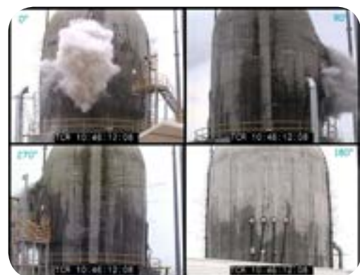
Containment Failure Test Prestressed concrete containment vessel model structural failure mode testing.