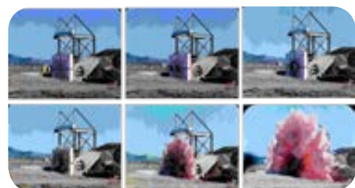
Containment Vulnerability Studies Water Slug Testing