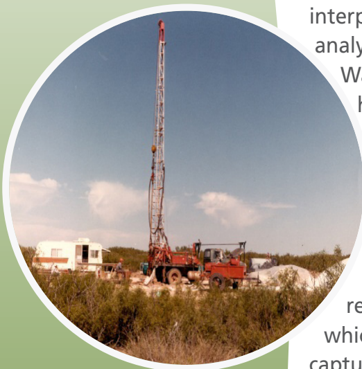
Test Well Drilling in SE New Mexico

More than 100 pumping tests have been conducted in the Culebra and Magenta Members of the Rustler Formation at