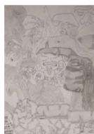
1 st Place: Erick Ramirez