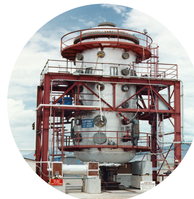
Surtsey test facility.

Washington, DC/ Palo Alto, CA: Nuclear Regulatory Commission/ Electric Power Research Institute.