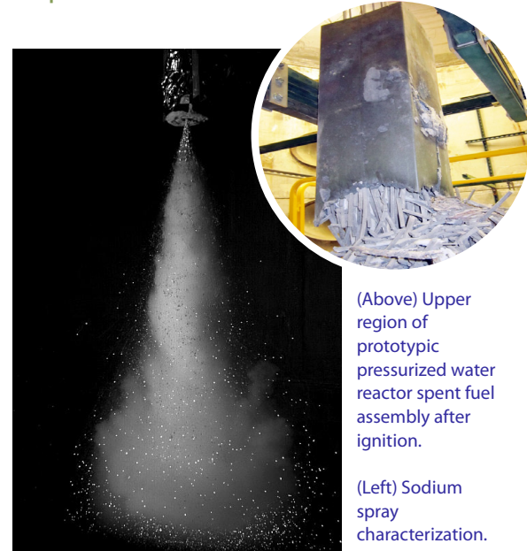
(Above) Upper region of prototypic pressurized water reactor spent fuel assembly after ignition.

Sandia's fire science research in nuclear energy infrastructure plays a significant role in ensuring the safe, secure, and responsible operation of nuclear power plants worldwide. In addition to providing the scientific basis for cable and circuit testing and evaluation, transportation vulnerabilities, metal fire phenomenology, and spent fuel pool ignition phenomena, Sandia's research is instrumental in developing accurate probabilistic risk assessments (PRAs). PRAs are used by industry and regulatory agencies to assess potential vulnerabilities by quantitatively characterizing risk through two factors: likelihood that the threat situation would arise and the severity of possible adverse effects. Through research and experimentation in areas including basic fire behavior, fire modeling, fire protection engineering, and structure fire protection regulation compliance practices, Sandia's nuclear fire protection work leads the field in characterizing and evaluating fire risks and protection strategies necessary for the safe operation of nuclear energy infrastructure.