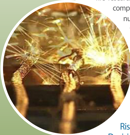
Electrical arcing behavior during dc-circuit fires.

The cable spreading room fire at Browns Ferry Nuclear Power Plant in 1975 illustrated the need for increased research into safety system reliability during abnormal events such as fire. Months prior to the incident, the US Nuclear Regulatory Commission contracted with Sandia to begin analyzing nuclear fire safety. For over 35 years, Sandia has conducted experimental nuclear fire research to address increasingly important and complex risk and reliabilities studies. Current nuclear-specific fire research investigates fire phenomenology and the effects of fire on various nuclear energy applications and components, including circuit reliability. Whether it's investigating fire induced small component failure or a large-scale configuration, this capability is used to quantify the overall fire risk of a nuclear power plant.