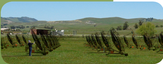
An array of 4th-generation CES concentrators using their proprietary direct-drive-to-ground sun-tracking system.

To enhance the nation's security and prosperity through sustainable, transformative approaches to our most challenging energy, climate, and infrastructure problems.