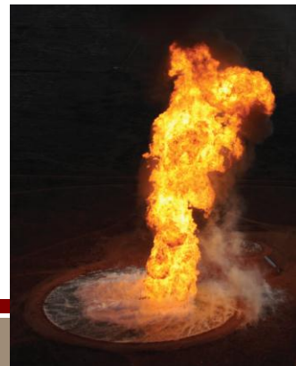
Image of 85-m pool fire that shows flames not extending across spreading (white area) LNG pool.