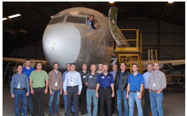
SHM Workshop Participants at the Sandia Labs Airworthiness Assurance Hangar Facility

Established at the height of the Cold War, Sandia's Kauai Test Facility (KTF) celebrated its 50 th anniversary this year with over 400 launches to its credit. Recently, a target rocket launched from KTF was successfully intercepted by the Navy's newest interceptor missile, the Standard Missile-3 Block IB.