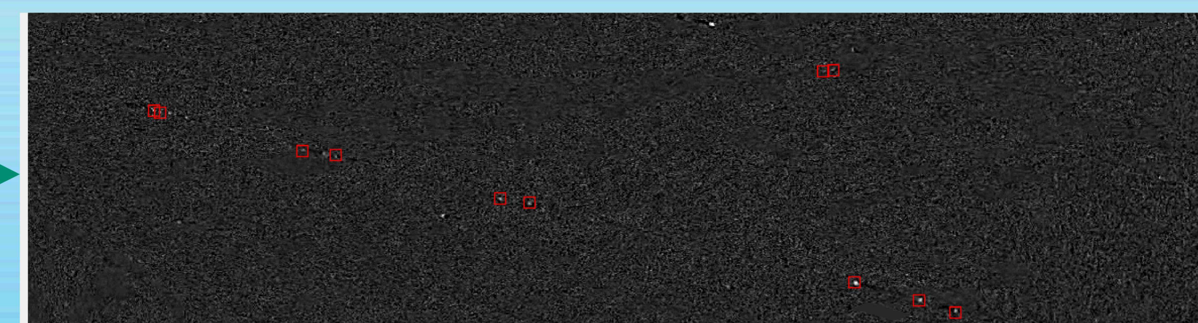
Detected Vehicles in Frame

Sandia Peak, 10,378 foot mountain region in Albuquerque, New Mexico