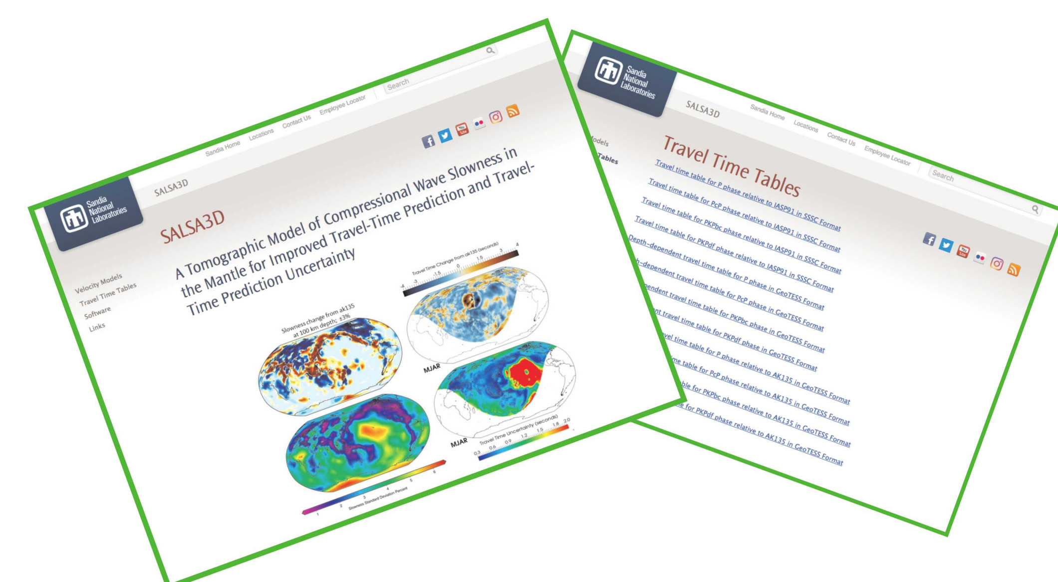
Figure 1: Images of the SALSA3d webpage located at www.sandia.gov/salsa3d . This website is the location where the SALSA3D models, travel-time tables and software products are distributed.