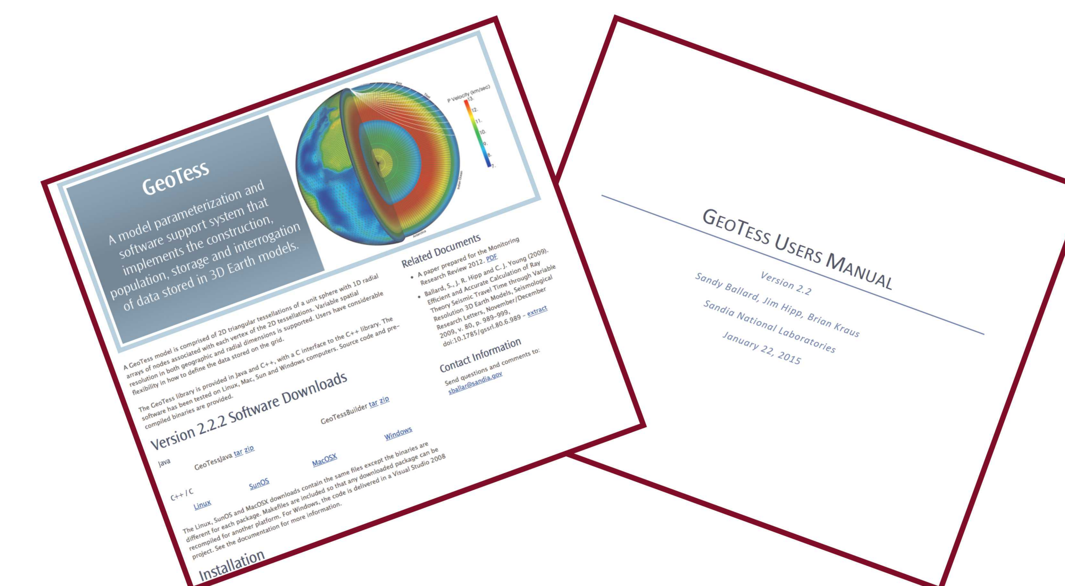
Figure 4: Images of the GeoTESS webpage and user manual available at www.sandia.gov/geotess