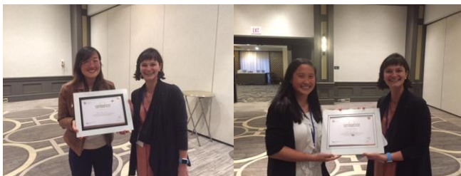
Presentation of the Student Poster Presentation Award